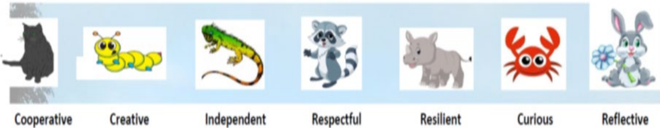
7 Learning Dispositions