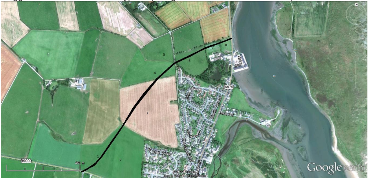
Suggested Line of Northern Bypass